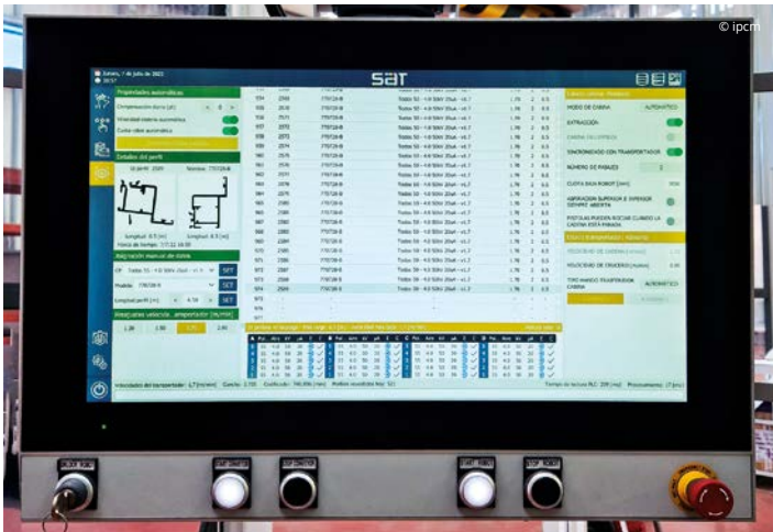
The VISICOAT system panel.

helical belts or conveyors to transit the aluminium extrusions from the vertical to the horizontal position for the unloading. Once the aluminium profiles reach the horizontal position, they are moved to the motorised unloading table for handling. This five belts unloading system is designed to process extruded aluminium profiles between 2 meters and 8 meters length. The Automated Unloader allows the customer to offload extrusions from their vertical powder coating system without adjusting the position of the unload system. The Automated Unloader is able to eliminate the gaps between the extrusions on the line and to minimise marring and bending of the parts as they move along the vertical curve of the conveyor.