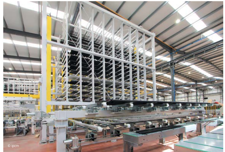
From top left clockwise: Powder application with Gema SIT technology; The powder centres of the two C-Expert booths; The automatic unloading system with five transport belts; Storage buffers housing the coated profiles to be sorted towards the assembly, packaging, and plasticisation lines.