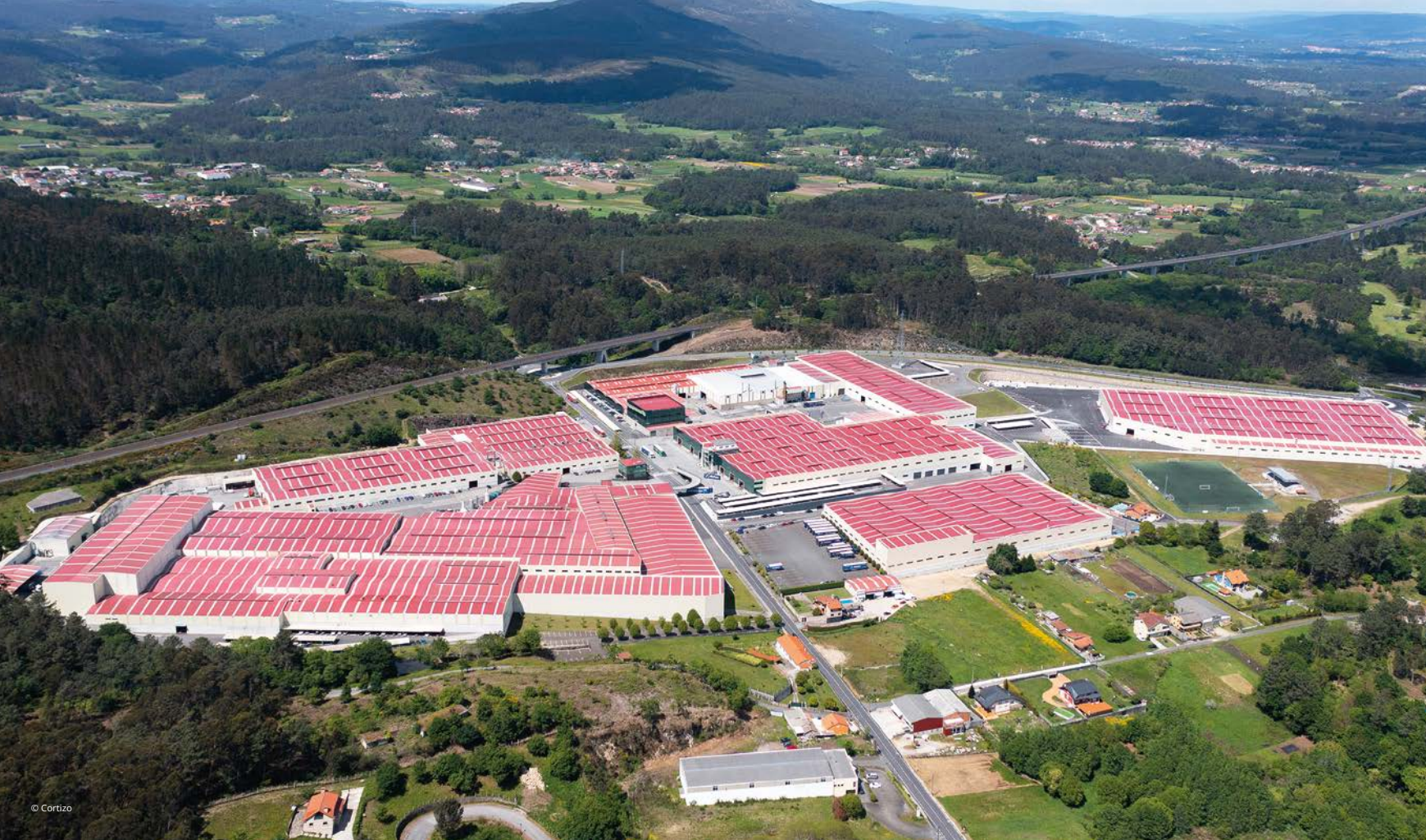
The CORTIZO's headquarters in Padrón (Spain).