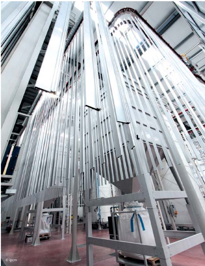
Profiles exiting the pre-treatment tunnel.